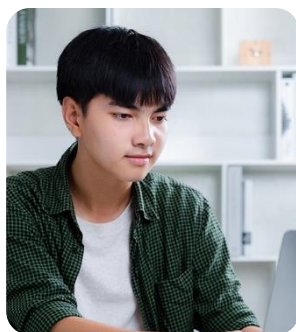
WAEC/SSCE for our West African students