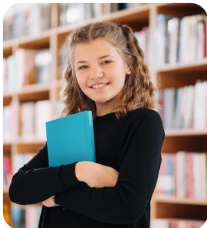
GCSE for our local students

We offer three broad curricula. Where topics are similar, we have used same learning videos in both GCSE and IGCSE. We are subject led and not grouped by exam boards.